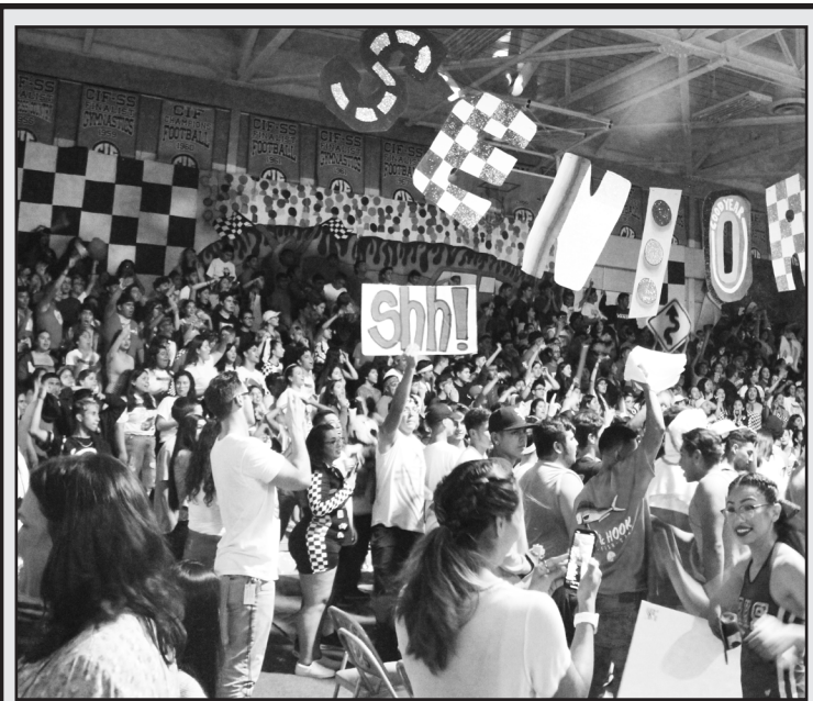
Seniors celebrate after their class skit.

Learn about Latino culture and its influence on other cultures. Take field trips to colleges and volunteer for community service. All students are welcome! Meetings take place on Wednesdays in G3.