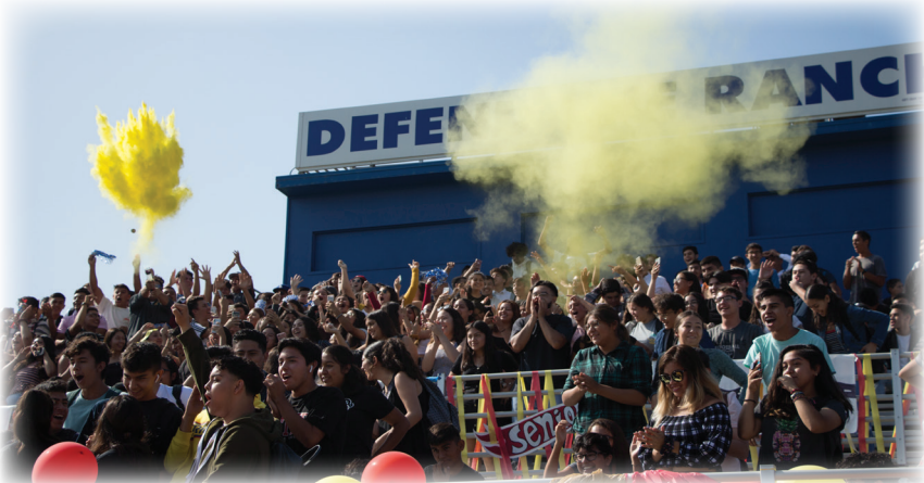
Seniors show blue pride at their last Welcome Back assembly.