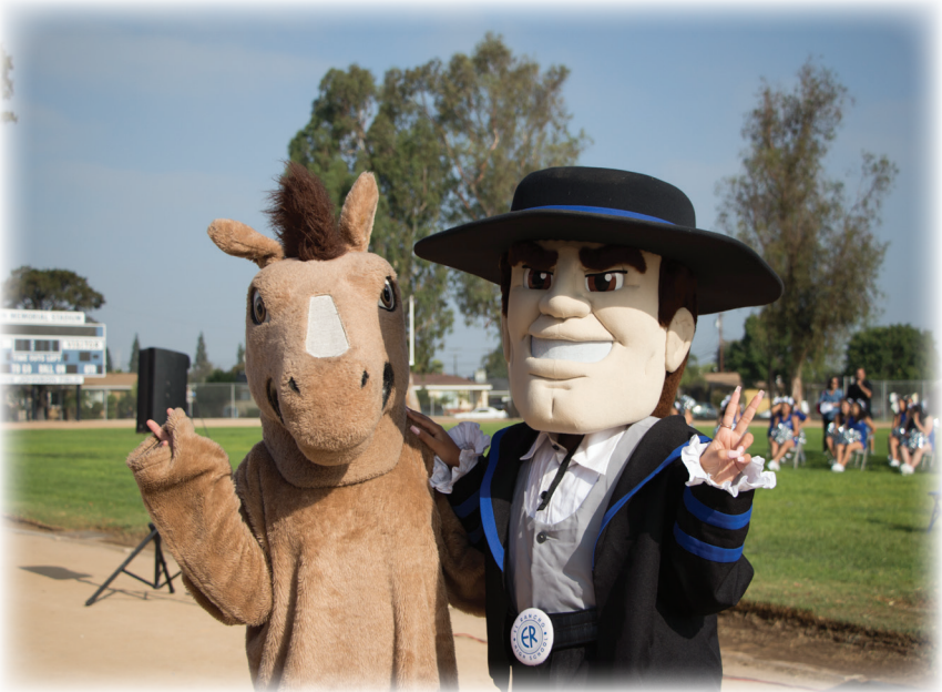
El Rancho's mascots posing at Welcome Back Assembly.