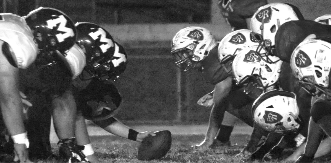
Varsity Football Dons take over Montebello with the score of 51-16