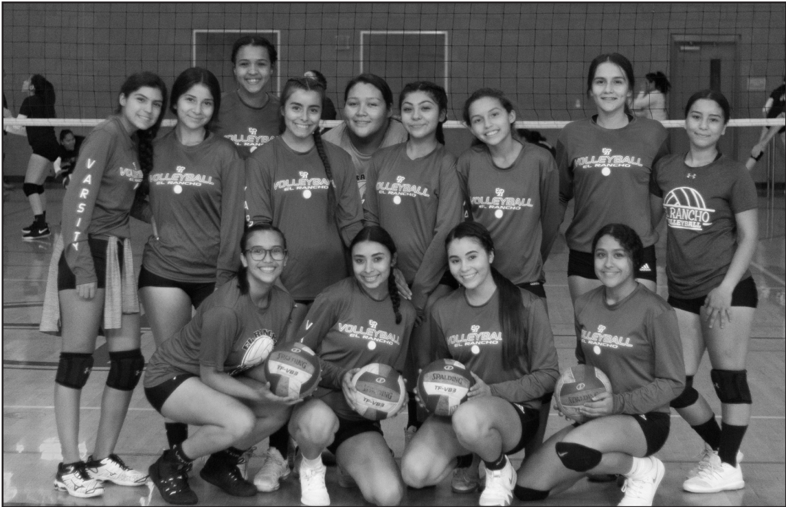
Girls’ volleyball before their game against the Condors