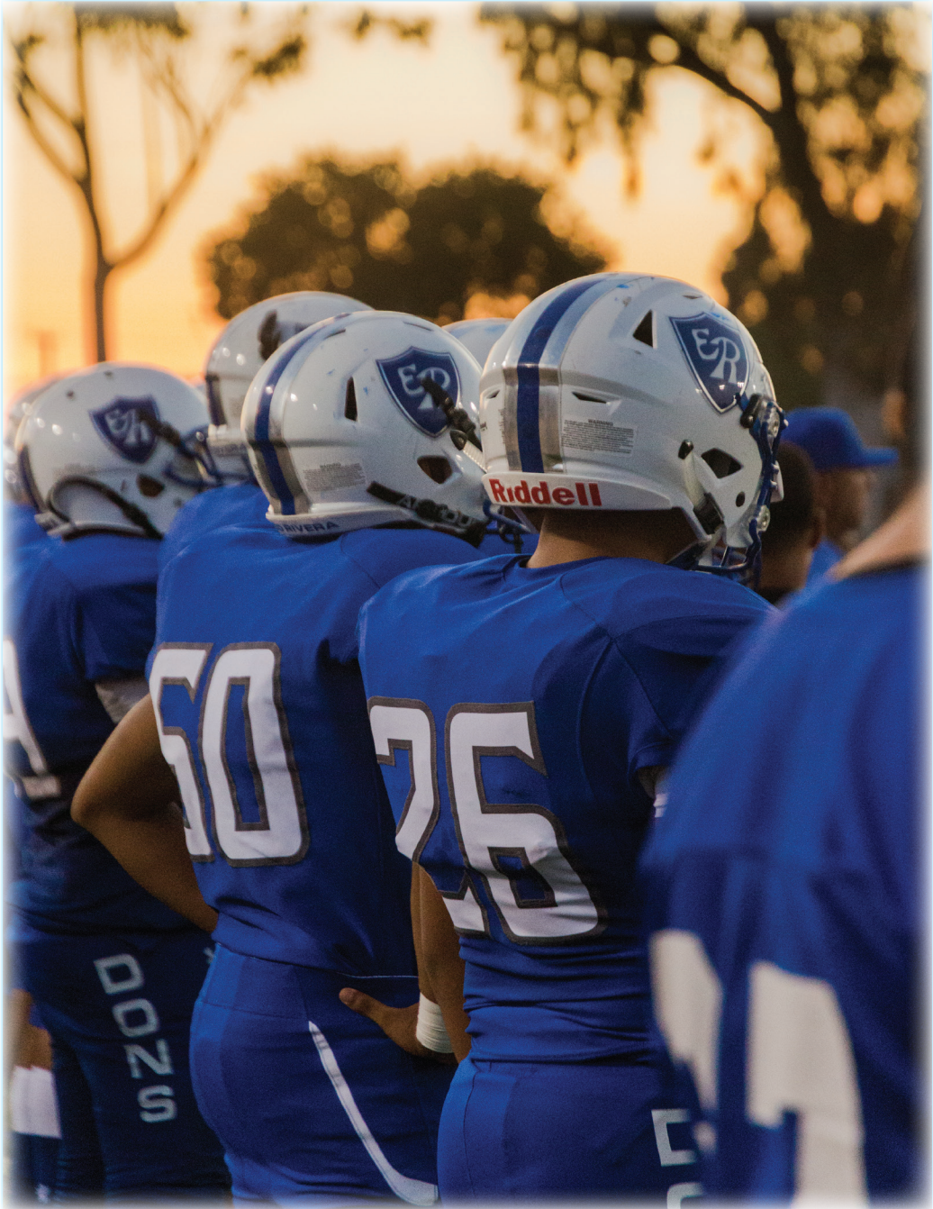
Varsity football team prepares for their game against Montebello.