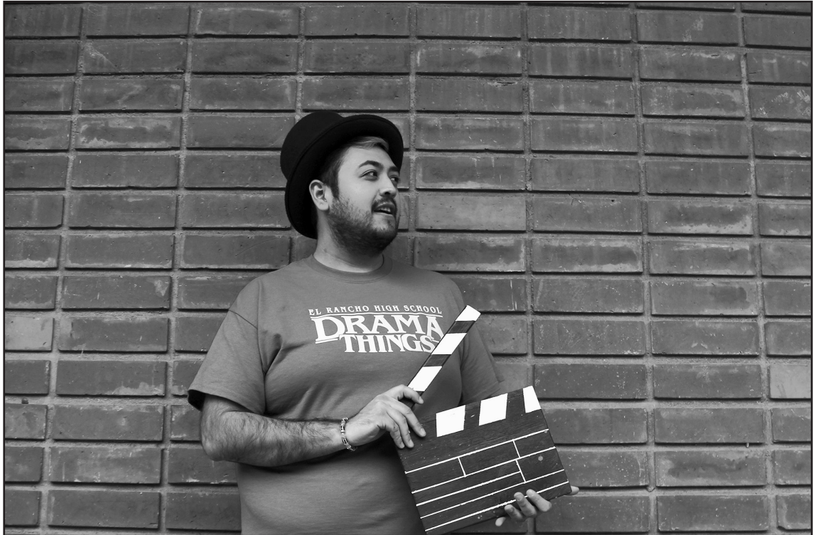
This former Jungle Cruise skipper loves all things Disney.