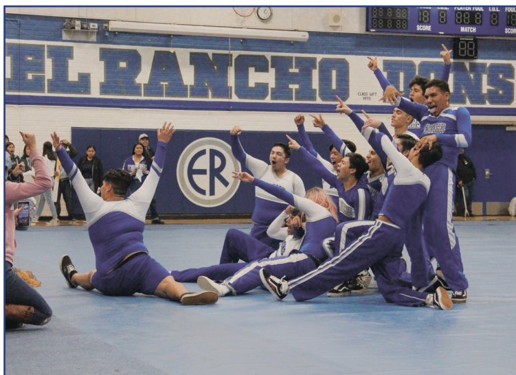
Senior pep squad wows the crowd!

“I think the game is going to be interesting because our plays have been coming together nicely, and I’ve heard the juniors