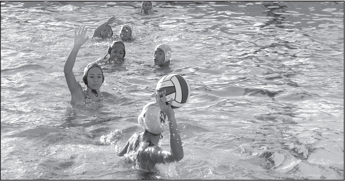
Girls’ water polo practicing their passes during a scrimmage.

Chavez. “However, they don’t have as much experience with water polo as our returners, and experience isn’t something that can just be handed to one.” They aim to strengthen themselves through reflection, analysis, and correcting mistakes. “Our weakness can also be considered our strength,” says Chavez. “[New members] are gaining experience with each game, playing at their highest potential, and are really helping the team.” “Although reflecting on mistakes we made after a loss can be frustrating, we discuss it as a team, learn from it and focus on improving those mistakes during the following practices and games to not repeat them & accumulate all the skills we can before the season,” continues Chavez. As league soon approaches, the team continues to grow and prepare for their upcoming games. “We run more drills during practice and have small ses-