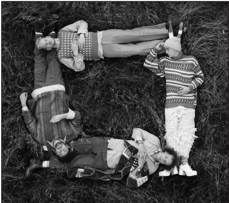
The 1975 poses to promote A Brief Inquiry Into Online Relationships.

tion to heroin. In typical The 1975 fashion, the song’s dark lyrics are masked in an incredibly upbeat song. If you didn’t look up the lyrics to this song, you would never know it’s a song about struggling with addiction. This track oozes elements of classic rock with a synth-pop twist that makes it almost impossible not to dance to! Up next on ABIOR is “I Couldn’t Be More in Love.” According to Healy, this song is about “what happens when no one cares anymore.” This track is the powerful ballad of the album. With an incredible guitar solo and Matty’s pain-filled vocals, this song is sure to bring tears to the eyes. His vulnerability and insecurity make him all the more relatable. The final song on ABIOR is “I Always Wanna Die (Sometimes).” This track is about the fascination society has with death. As Matty said in an interview with Genius.com , talking about dying has almost become a meme of sorts and that was what