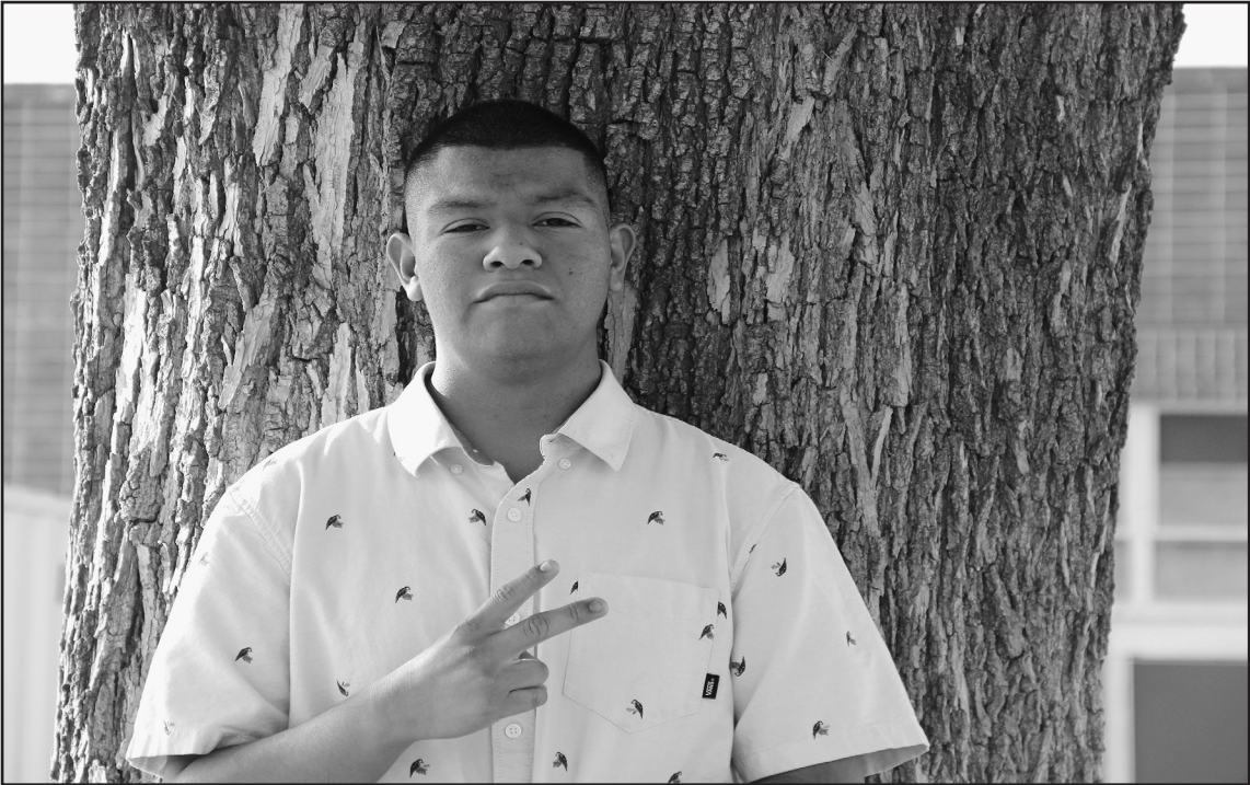
The man, the myth, the legend posing for a shot.