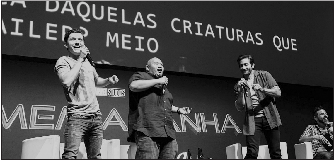
Tom Holland, Jacob Batalon, and Jake Gyllenhaal speaking at Comic-Con Brazil. (listed from left to right)