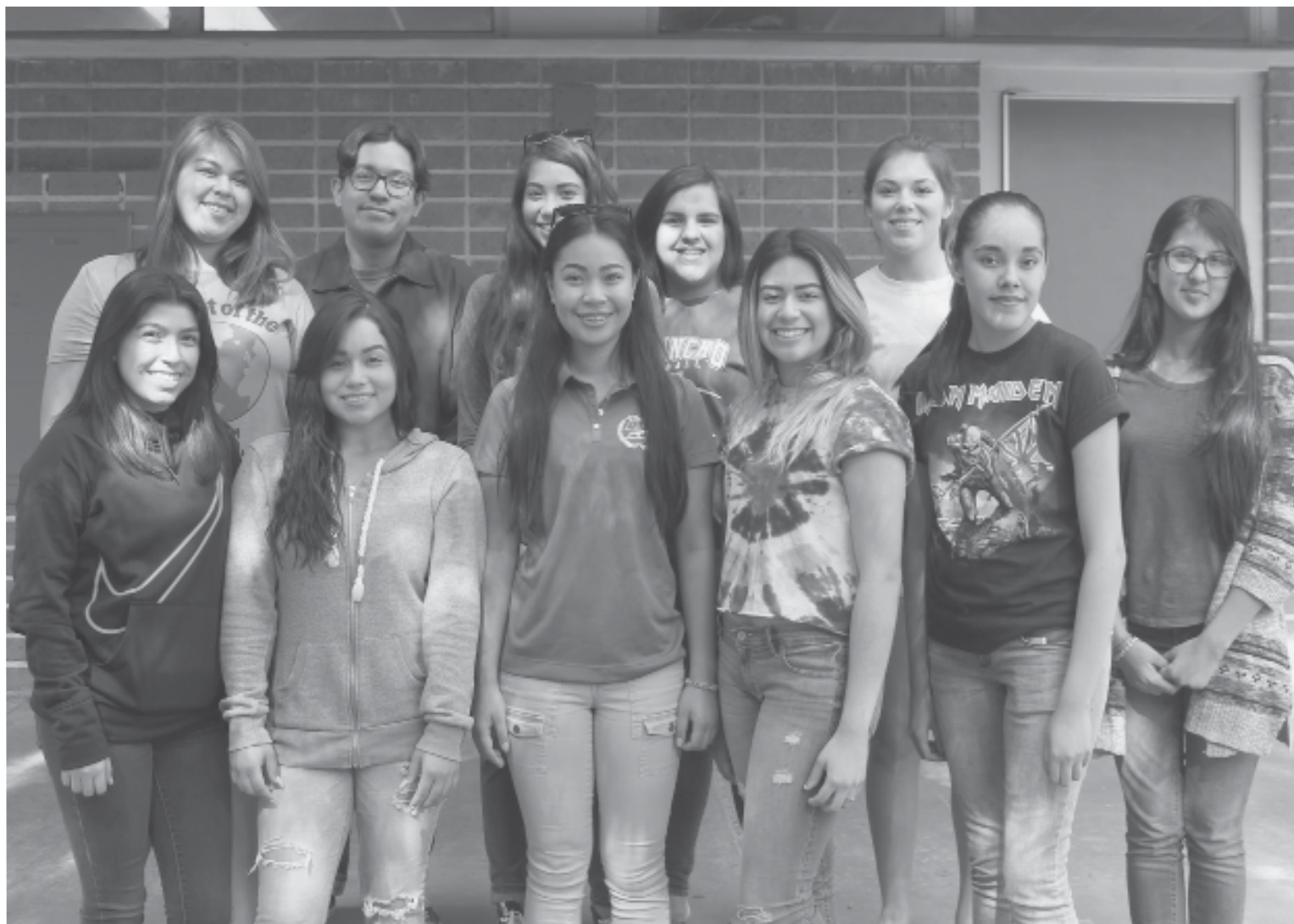
The Entrepreneur Club looks forward to new opportunities involving the City of Pico Rivera.

The club pitches ideas as to how the segment will run. The plan involves dividing it between organizations and clubs to assemble the segment each month. One of the ideas requires having a representative from each club giving his/her portion of the segment to the club. The students would then