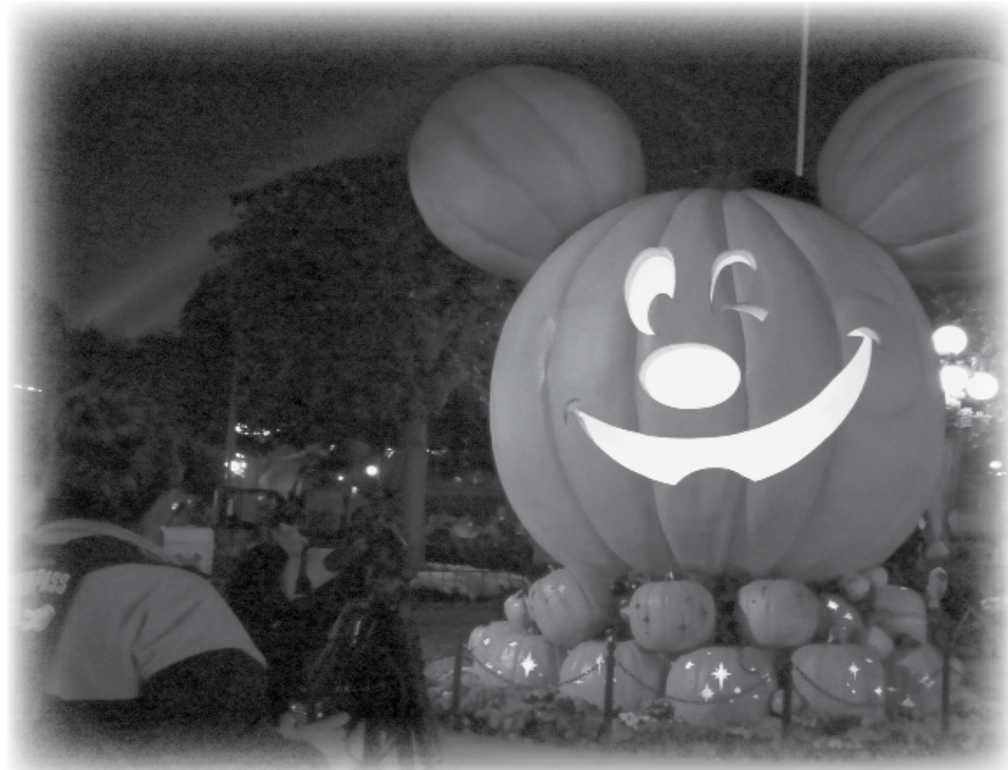
The famous Halloween decor displayed at Disneyland theme park in Anaheim, California.

In case Disney visitors did not know, Disneyland's theme