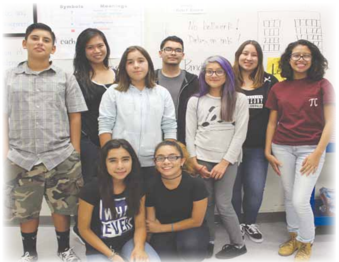
The mentors of the Successful Educational Achievement Program pose for a photo after a day of tutoring.