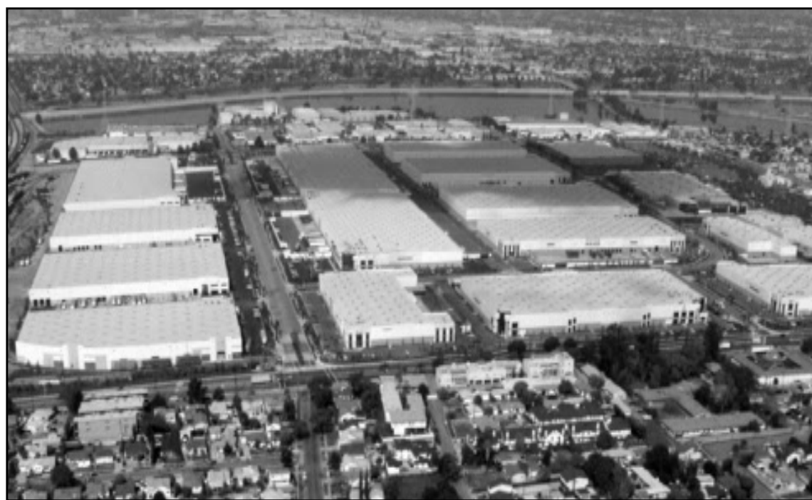
Northrop Gruman Corporation in the late 1980s, Pico Rivera.

In our local Pico Rivera Walmart, residents have seen United Nations vehicles on the property. Multiple sightings of