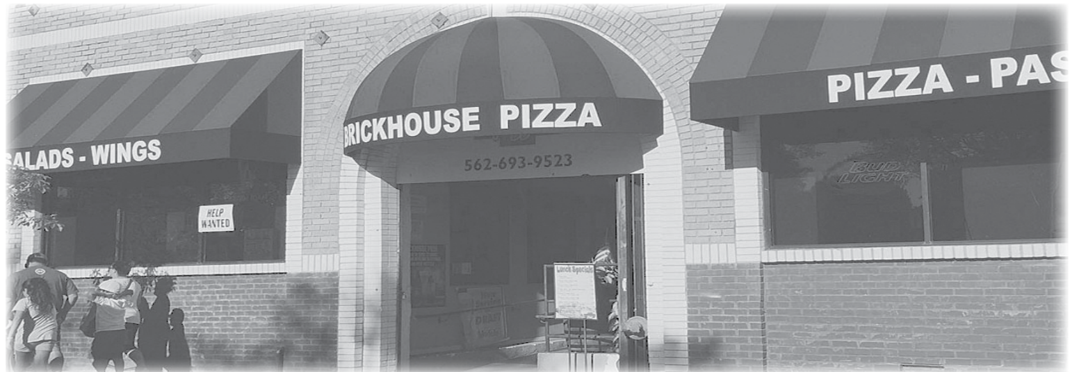
The restaurant, Brickhouse Pizza, attracts many customers because of their delicious pizza, pasta, etc.

Located at 7028 Bright Avenue, Whittier CA, this small but cozy establishment is divided into three dining areas and has a mini game room for the kids. The second you walk in you would be greeted with a chorus of friendly hellos and welcomes from a bubbly staff. Brickhouse Pizza is a family friendly restaurant and visited daily for their pizzas, pastas, and sandwiches.