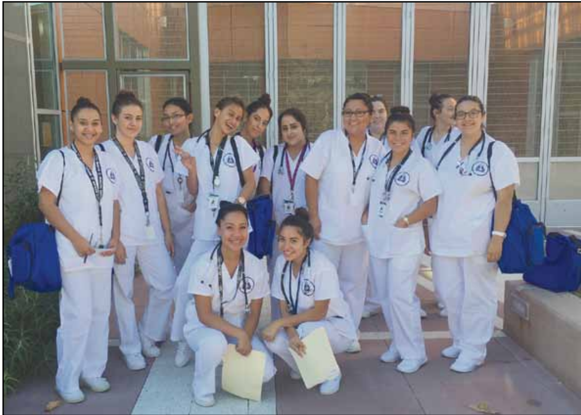
The Emergency Medical Responders attend a field trip to further explore a career in medicine.

ROP courses are available to any high school student who is 16 years of age and older. However priority is given to those who are residents to areas of Pico Rivera, Santa Fe Springs, Whittier and Norwalk. The classes available on campus are: Administration of Justice, Forensics, Foods and Nutrition, Foods and Hospitality, Sports Medicine, Emergency Medical Responder, Business Internship, and Marketing. The classes that are not offered on campus are: Administration of Justice in Whittier HS, Fire Technol-