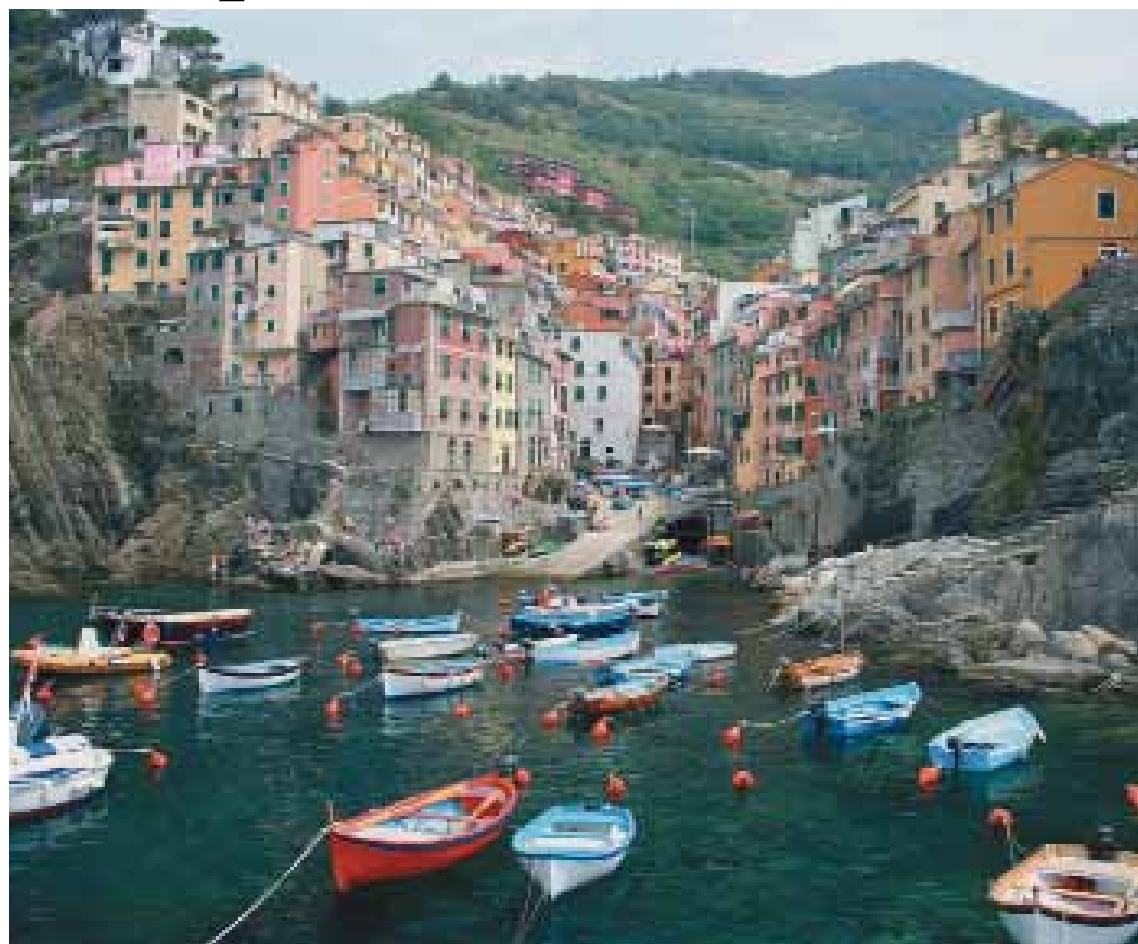
Cinque Terre, Italy is one of the destinations on Gadabouts, 2017 summer excursion.

The Gadabouts will spend three days in Switzerland where they will see Lion Monument and the Chapel Bridge. They will also ride a cable car to the top of Mount Pilates, which has a beautiful overview of the entire valley. On days four and five they will be exploring Cinque Terre by train and participating in a photography lesson. Days six through eight will be at the French Riviera and Provence in France. Travelers will be able to take a tour of the Principality of Monaco to see the Prince's Palace, Monaco Cathedral, and the Monte-Carlo Casino. The following day they will see the Vieille Ville and the Promenade des Anglais, then visit Pont du Gard, Nîmes, the Nîmes Amphitheater, Avignon, and the Palais des Papes. In Provence, the students will take a cooking class. Days nine and ten will be held in Barcelona, Spain where the Gadabouts will take a bike tour of the city. Then they will see La Sagrada Familia, Montjuïc Hill, Barrio Gótico and the Barcelona Cathedral with a dance class for the tourists. The extended three-day