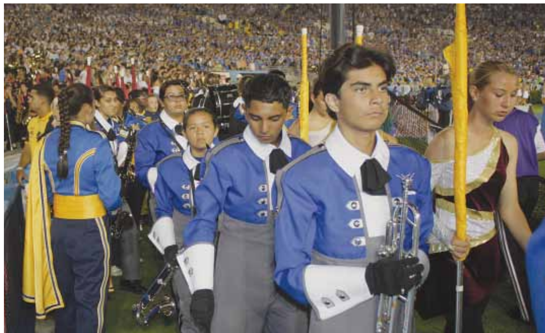
El Rancho Marching Band joined the UCLA Marching Band at half-time of the UCLA-BYU game.