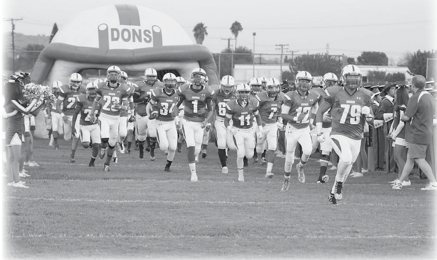
The football team storms onto the field ready for their first home game.