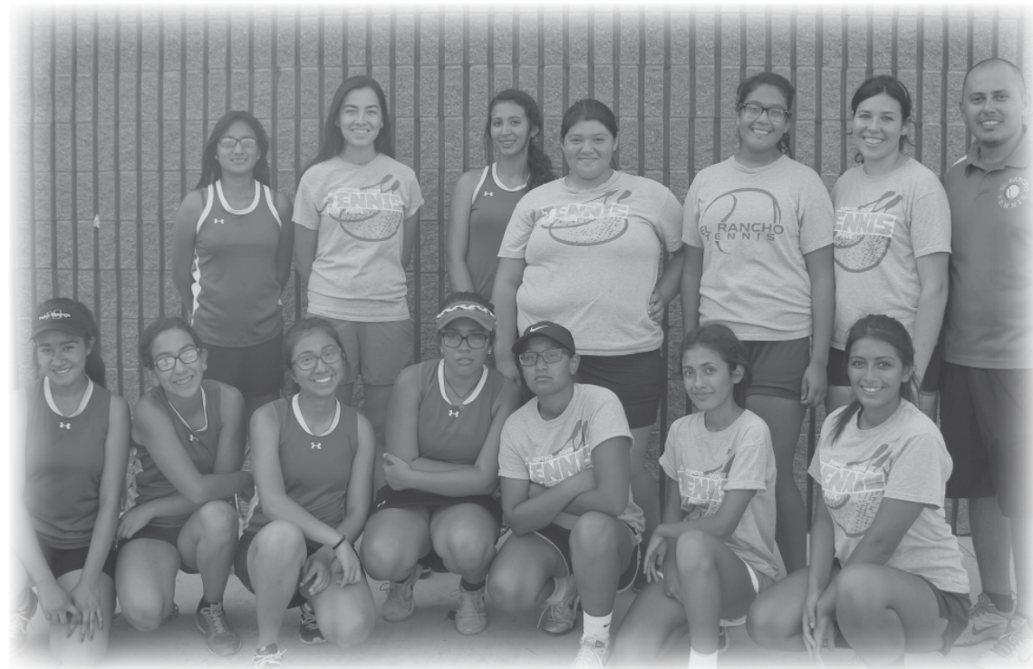
Varsity tennis team warms up for their home game.