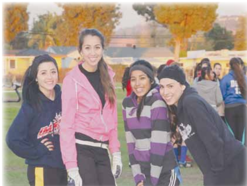
Seniors demonstrate enthusiasm at Powderpuff practice.