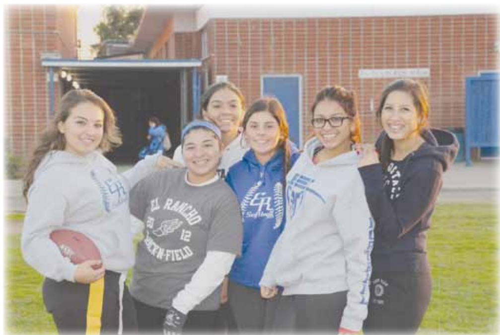
Seniors creating memories at Powderpuff practice.