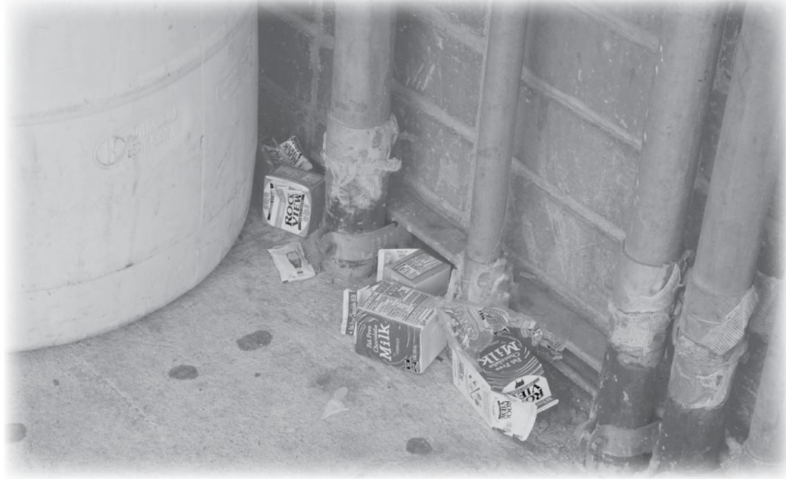
Students neglect to properly throw their trash into the campus trash cans.

It is not like students do anything to prevent these seagulls from invading our campus. Students should take a good look at the quad after lunch, juice boxes and taco nada wrappers are scattered right by trash cans . It's as if students try to "shoot" their trash into the trash cans but miss. It's sad that students choose to leave their trash on the ground. If that's the case, then students have no right to complain about the sea gulls and their poop.