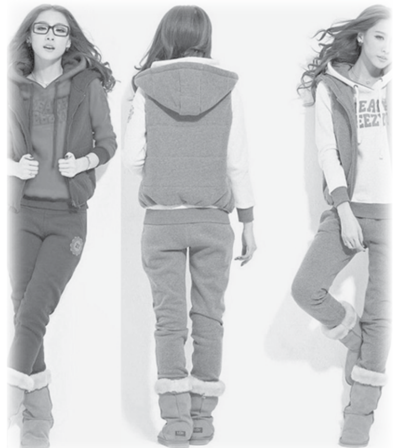
As the winter season begins to roll in, new styles start to emerge.