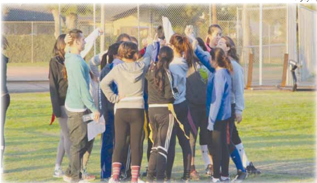
Seniors preparing to dominate juniors at Powderpuff.