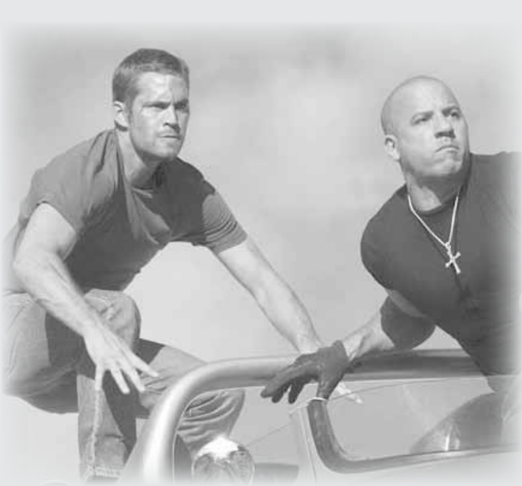
Fast and the Furious fans mourn over the death of Paul Walker.