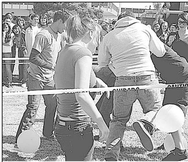
El Rancho students were determined to pop each other's balloons in order for their class to win the Homecoming games.