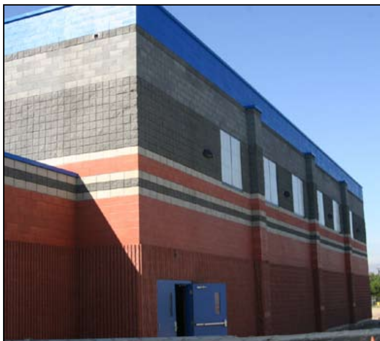
The new gym will finally be finished by December 24, 2008 but will it be worth the 5.2 to 6.2 million dollars.

MARICRUZ CASTRO-SPENCER EL RODEO STAFF WRITER