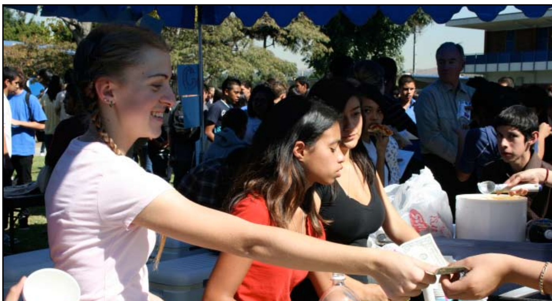
CSF sold Root Beer floats at the Homecoming Carnival to El Rancho students to fundraise money for future events and for their own club that will benefit other students that join this club.