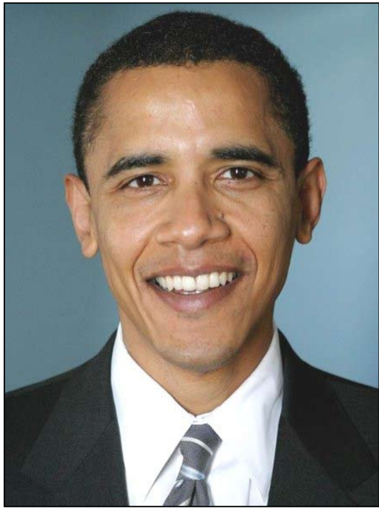
Senator Barack Obama is running against Senator John McCain in the 2008 presidential election