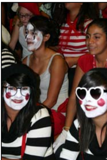
Freshman mine girls look at a victory that nobody was expecting out of them.

"The freshman did great, they had a lot of help from their advisors, and I was really surprised that they came in third," said