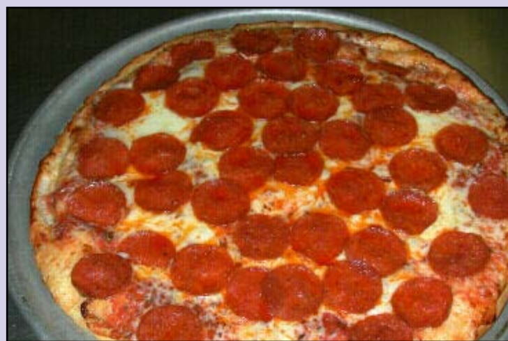
Tasty, warm, pepperoni pizza from Rio's pizza parlor.