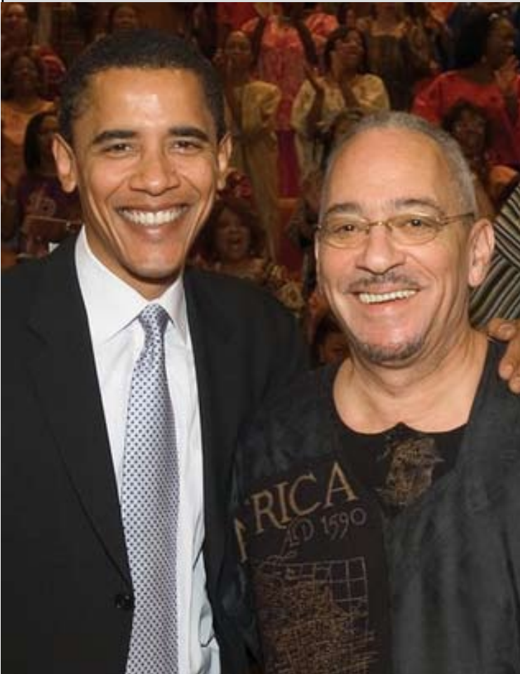
Obama and His Pasture Jeremiah Wright who created his political scandal with the media.

Whether or not Obama was actually present and clapping while Wright was damning American will never be known. The truth is that if Wright had nothing whatsoever to do with Obama he would most likely be happily retired in his house having a delightful sip of coffee watching some other fool being scrutinized by the monstrous media.