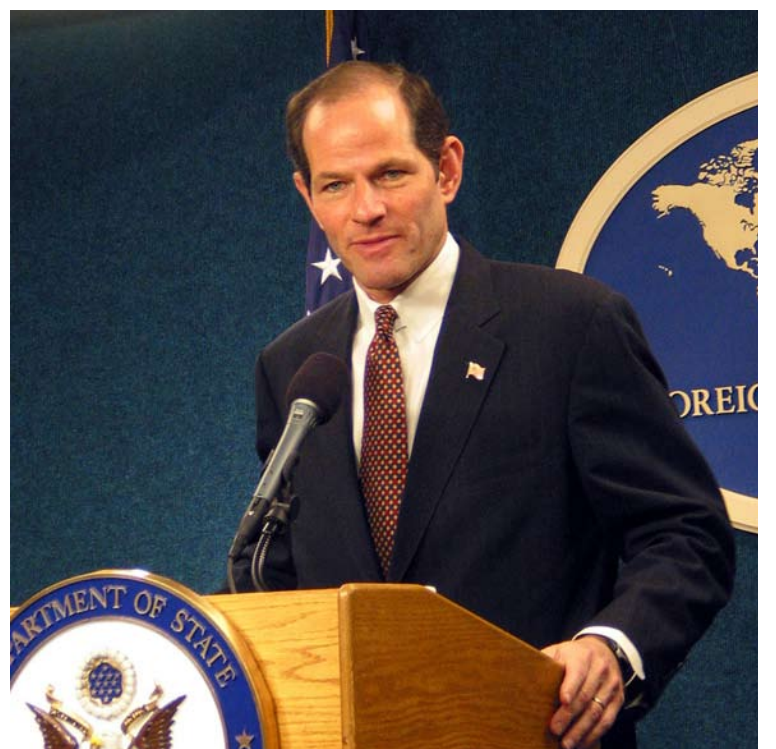
New York Senator Eliot Spitzer apologizes about his past mistakes.

Eliot Spitzer is simply looking for a scapegoat that puts his mind at ease about being a good parent, relieving himself of more responsibility. Like all par-