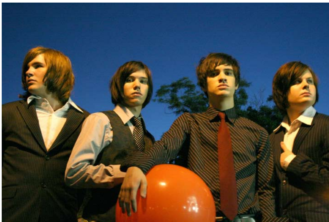
Pretty Odd is Panic! At the Disco's sophomore album to their 2005 A Fever You Can't Sweat Out which sold over 2.2 million records and had the hit "I Write Sins Not Tragedies"

"Panic" uses a variety of instruments creating a classical, dance, rock mix-yet the sound