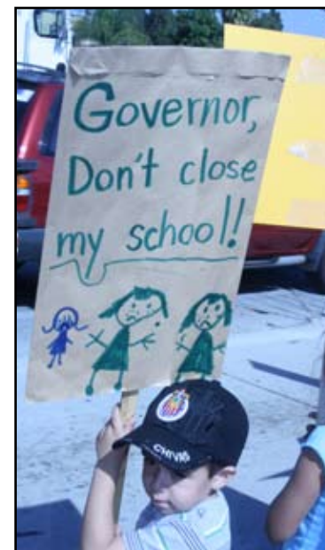
With up to four elementary schools closing, children's education will take a major hit.

James Ramirez, a bystander at the protest summed up the situation in three sentences, "The Governors proposal is a short term solution that's creating a long term problem. These kids are our future. If they aren't properly educated, we're setting ourselves up for failure,"