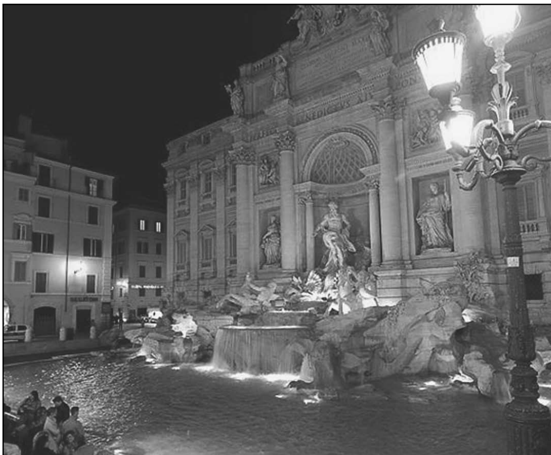
Rome, one of the many places that will be visited by the M.E.Ch.A. tourists.