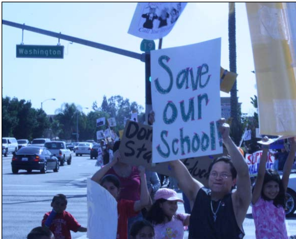
More than 800 participants protested on the street corners of Washington and Rosemead.