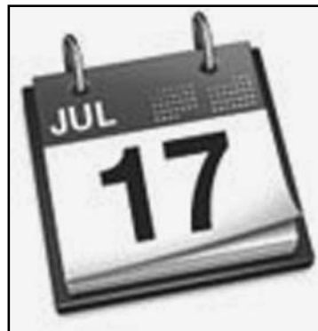
Time is running out for Seniors.

Wed. June 4 th : Scholarship Dessert 6:30pm ER Cafeteria - Please dress appropriately and be on time. All guests other than students must pay an admission fee at the door.