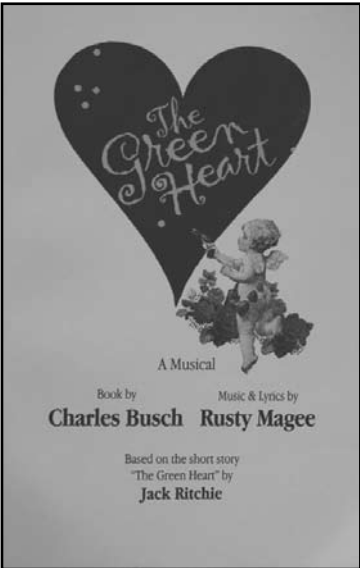
A cover of the play The Green Heart based on Jack Ritchie’s novel.