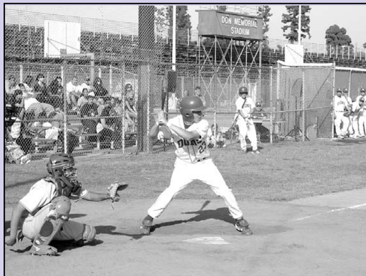
El Rancho's baseball team: Del Rio Champs again.