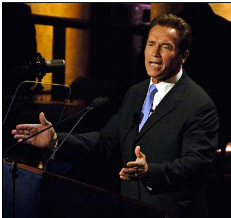
Governor Schwarzenegger's budget cuts will affect El Rancho teachers worse than expected.

These letters are used to inform the teachers of the possibility of layoff for the next school year. Every year the district needs to dismiss teachers, the last day to notify them is March 15. Due to the budget crisis and the district's actions toward schools, teachers looked