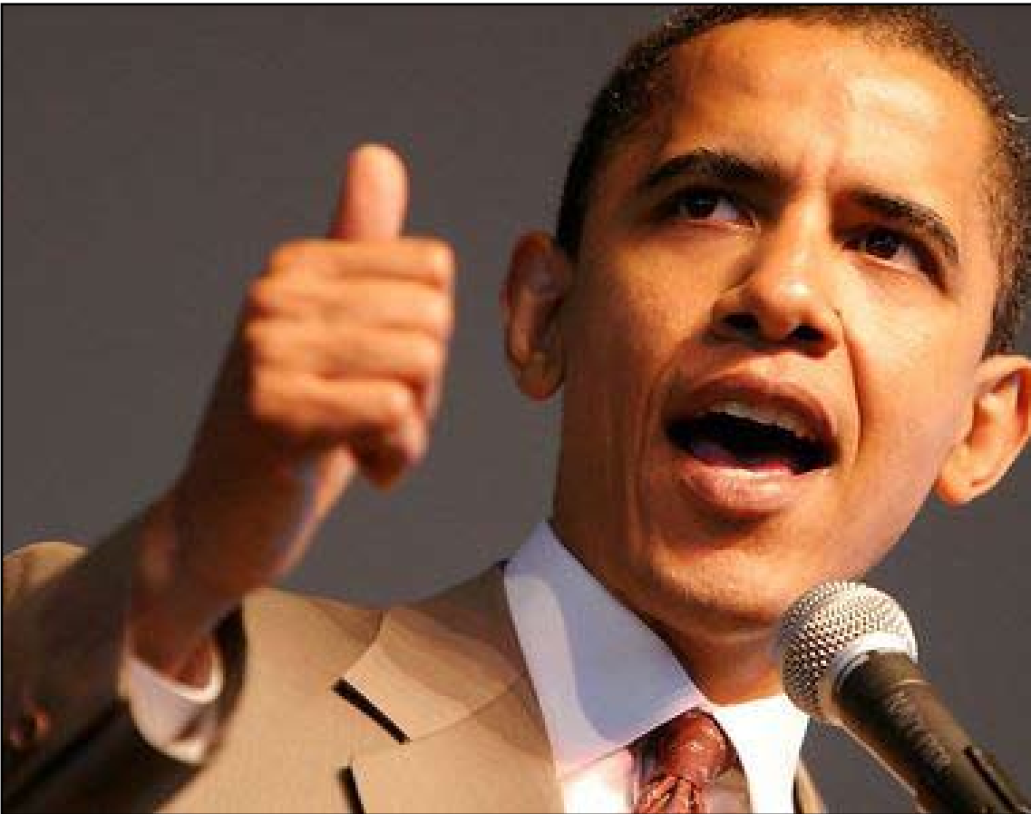
Does Barack have what it takes to become the net president? Is he prepared to solve Americas Problems.