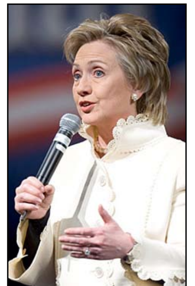
Hillary Clinton gives speech to win the support of Pennsylvania.

Although she scored these key wins Obama is still ahead on the delegate count with 1,520 compared to Clinton's 1,424. Still, neither candidate is very close to the 2,025 needed to obtain the Democratic Presidential nomination and start campaigning