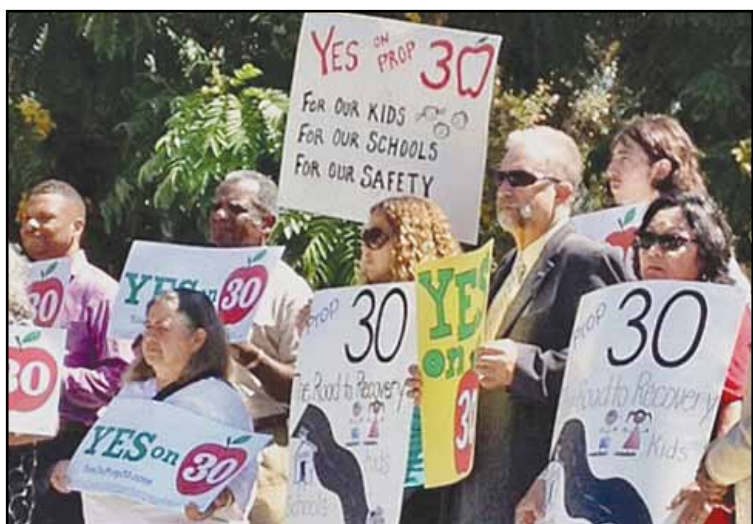
California Teacher's Association members show support for Prop 30.

By KARLA VIRAMONTES EL RODEO STAFF WRITER