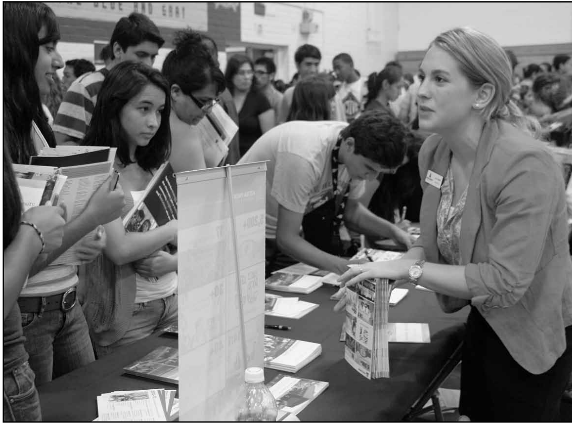
Azusa Pacific University captured the interest of many Dons on College Night.