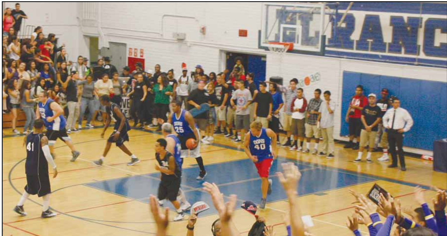
Dons cheer on the El Rancho staff as they battle the Power 106 All-Stars in a hard fought game.

The Power 106 basketball game was not the only entertainment given; players from the LA Galaxy soccer team ar-