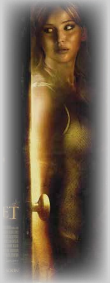
Jennifer Lawrence stars as the leading lady in "House at the End of the Street."