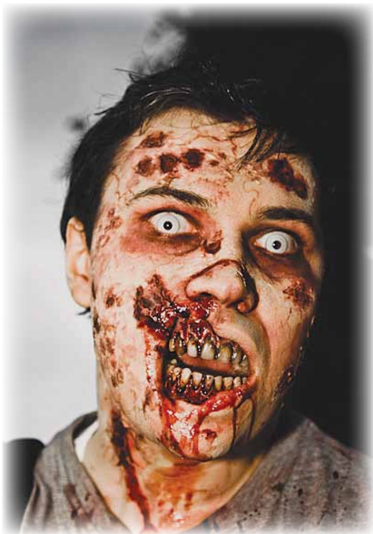
A portfolio picture from Yuki Kimuro, who was a member of the makeup department for the cult classic "Dawn of the Dead."

If you're looking to someday be an esteemed international make-up artist, media make-up classes are your best option. The duties of media make-up artists branch out extensively.