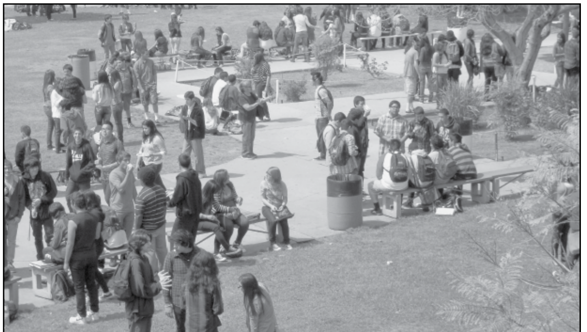
El Rancho student body is a tremendous purchasing power in local business in the City of Pico Rivera.

of surveying the El Rancho student body and collecting the appropriate data, the Entrepreneur Club's team of class analysts put together the following profile on the spending habits of the typical El Rancho high school student. The club found that the average El Rancho student receives an allowance of about $18.64 per week. The average Don does not have a part-time job, but spends about $22.85 each week. The club's data reflects a trend in student spending that sees the average student spends most disposable income on food, followed closely by clothing. The typical student is willing to pay about $15 per month for an unlimited bus pass, which is about half the current price. When looking to increase spending in Pico Rivera, the average student would need the incentive of lower sales taxes. When the club's sample was polled on what services the school should