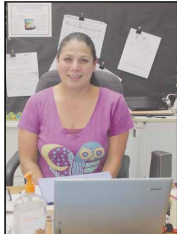
Former elementary teacher joins El Rancho staff.