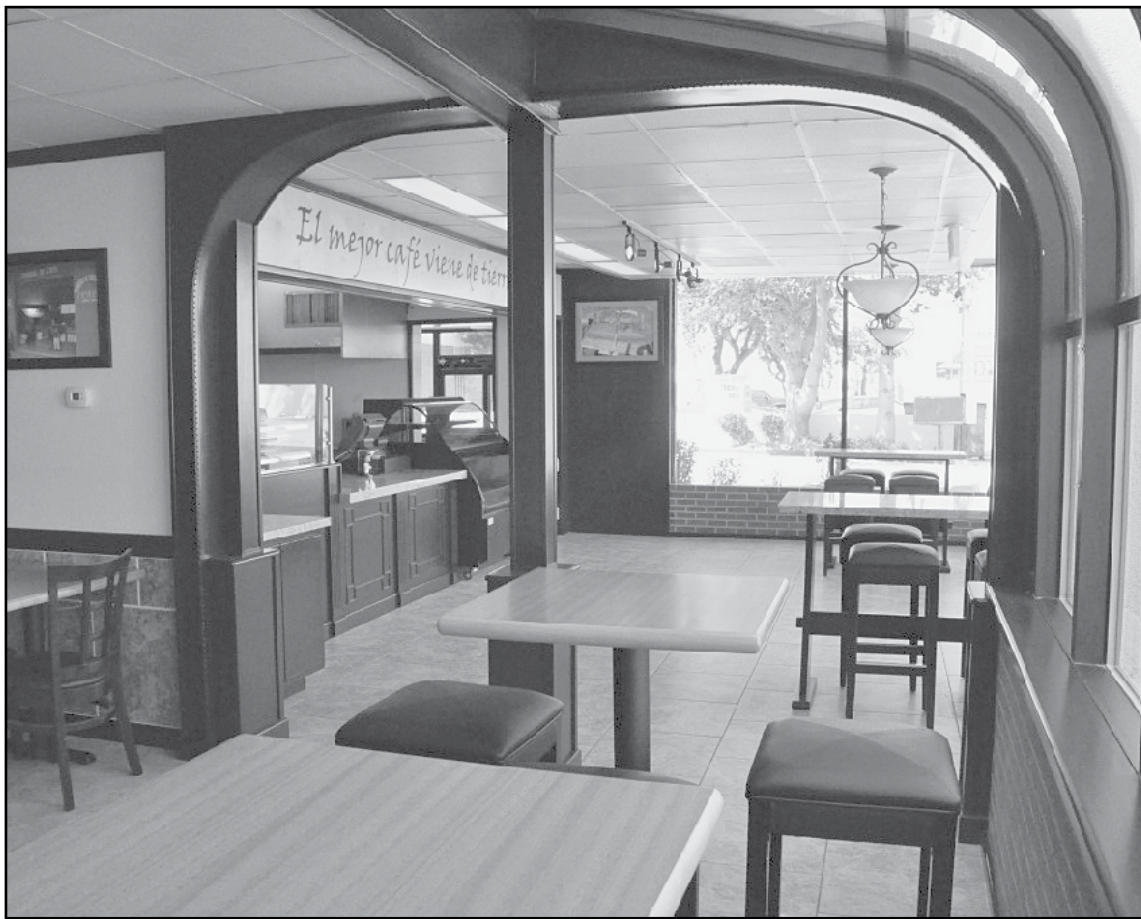
At Tierra Mia you are welcomed by a rustic, modernized interior with a Hispanic twist.